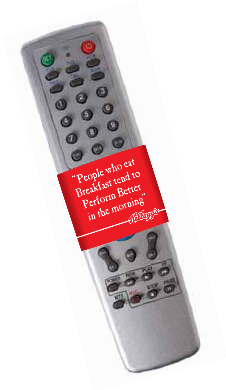
Kelloggs Hotel POS Remote Wrap